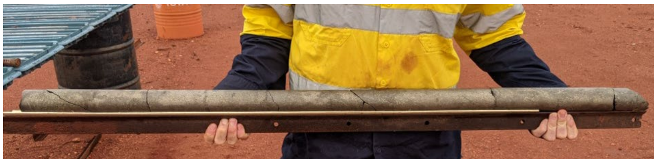
Drill core with massive nickel-copper sulphides from MAD199

“Our ongoing systematic exploration at the West End and Investigators Prospects has produced excellent results this year including a new, deeper discovery at MAD199 and a growing number of downhole EM conductors.