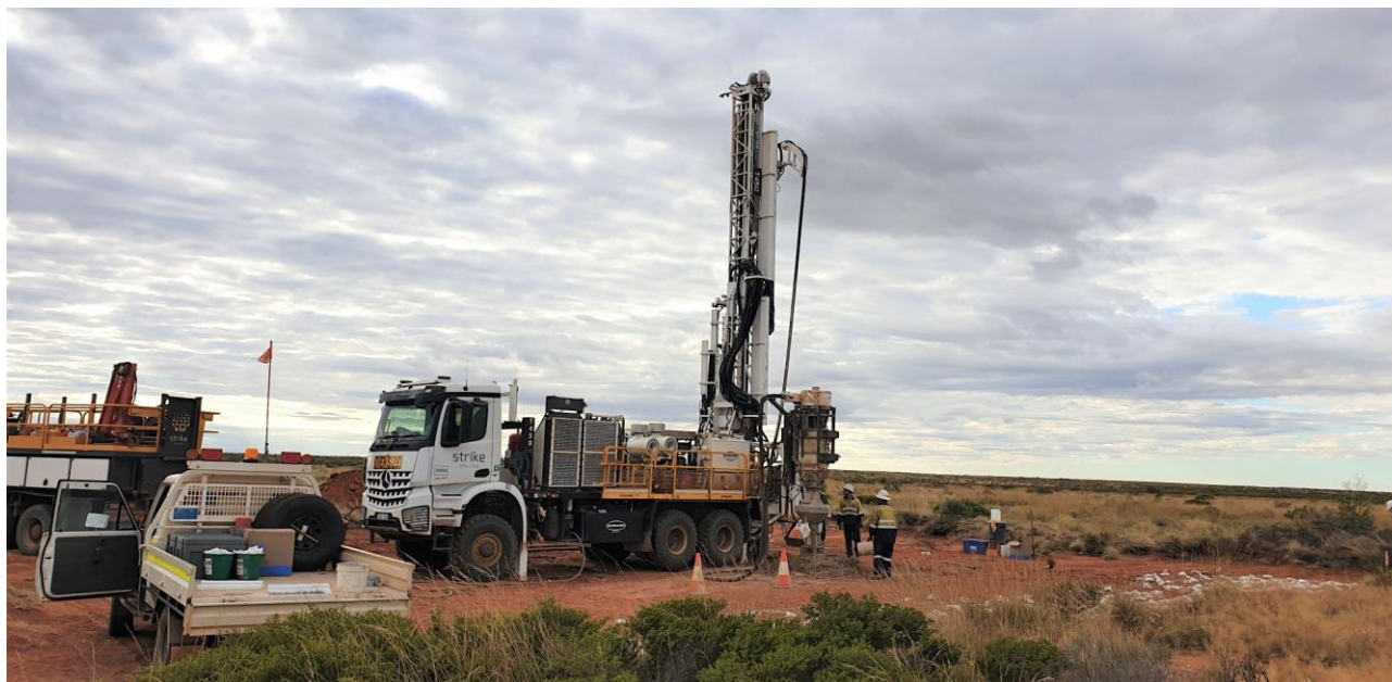
Figure 2 – RC drilling underway at the Paterson Project.

The current drill programme is expected to take eight weeks to complete, with approximately 50 holes to be drilled.