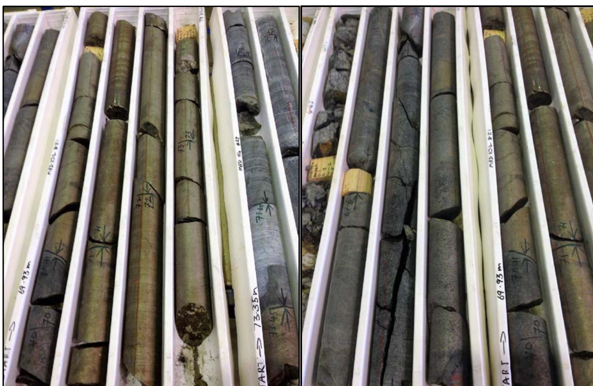
Figure 1 – drill core from MAD104. On left: massive sulphides from 70.1 to 73.44m. On right: matrix sulphides from 67.2m to 70.1m.

The implication is that there is potential for further sulphide mineralisation to be present along the Stricklands ultramafic (and potentially at the other prospects along the Cathedrals Belt) that has not been detected by surface EM surveys. With mineralisation at Stricklands open to the west, north and east – and areas with minimal drilling and DHEM surveys completed – there is potential for further significant mineralisation to be discovered.